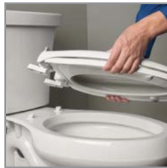
EASY REMOVAL OF SEAT FOR THOROUGH CLEANING