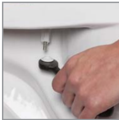
STA-TITE® SEAT FASTENING SYSTEM™