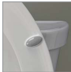
SUPER GRIP BUMPERS™